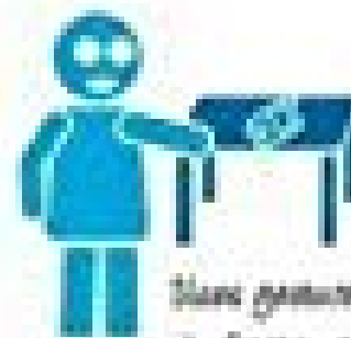
Uses gestures to indicate needs