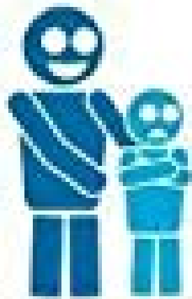
May not show cuddling or air cuddling