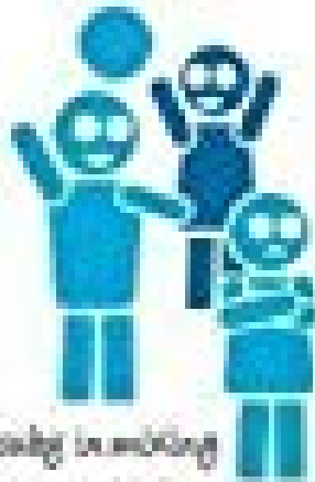
Difficulty in mixing with other children