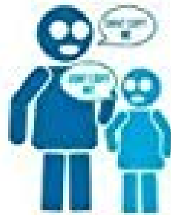
Echoes words or phrases