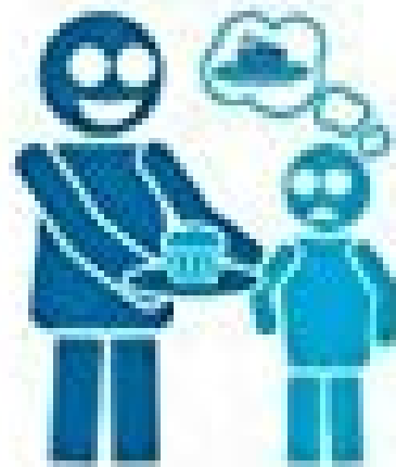
Endurance on something