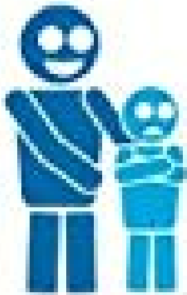
May not have cuddling or air cuddly