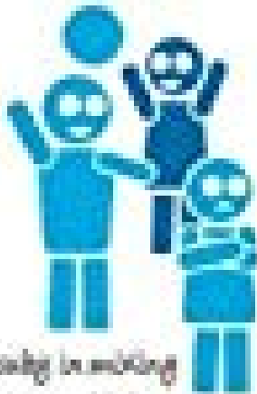
Difficulty in mixing with other children