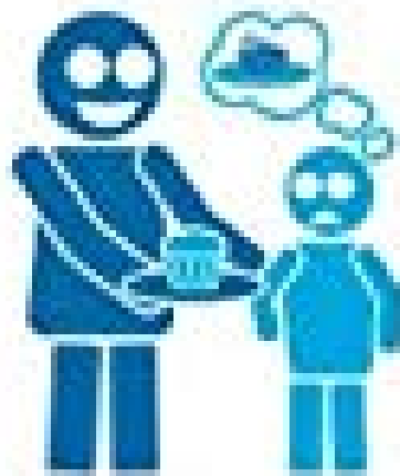
Insistence on sameness