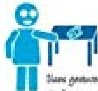
May gesture to indicate needs