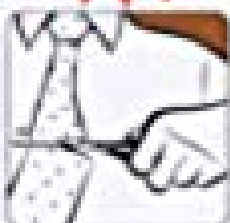
Quit Your Job P. 214