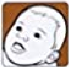
Hold a Baby P. 233