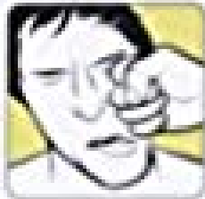
Throw a Punch P. 177