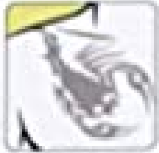
Get a Tattoo P. 239