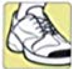
Run a Marathon P. 205