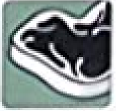
Cook the Perfect Steak P. 240