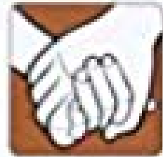
Make the First Move P. 188

ALL THE SKILLS YOUR FATHER NEVER TAUGHT YOU!