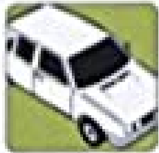
Buy a Used Car P. 237