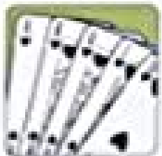
Keep a Poker Face P. 222