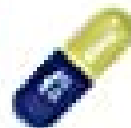
Cymbalta 60 mg