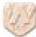
Effor 100 mg