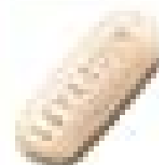
Levaquin 500 mg