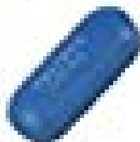
Valtrex 500 mg