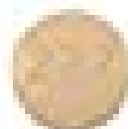
Januvia 100 mg